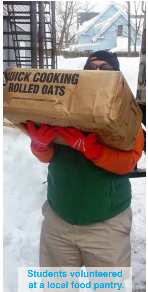
Students volunteered at a local food pantry.