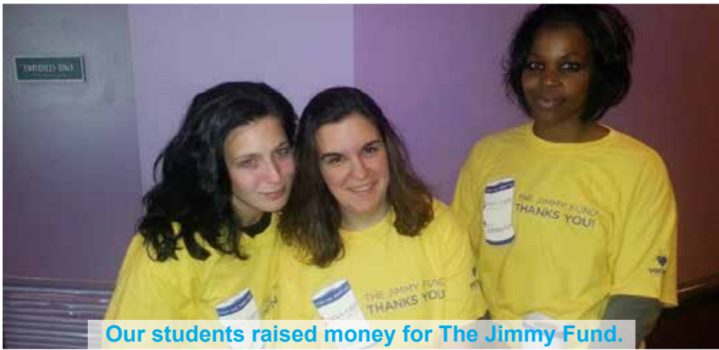
Our students raised money for The Jimmy Fund.