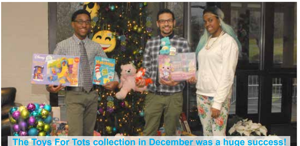
The Toys For Tots collection in December was a huge success!