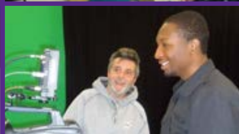
Students take a video production class at Stoughton Media Access Corp.