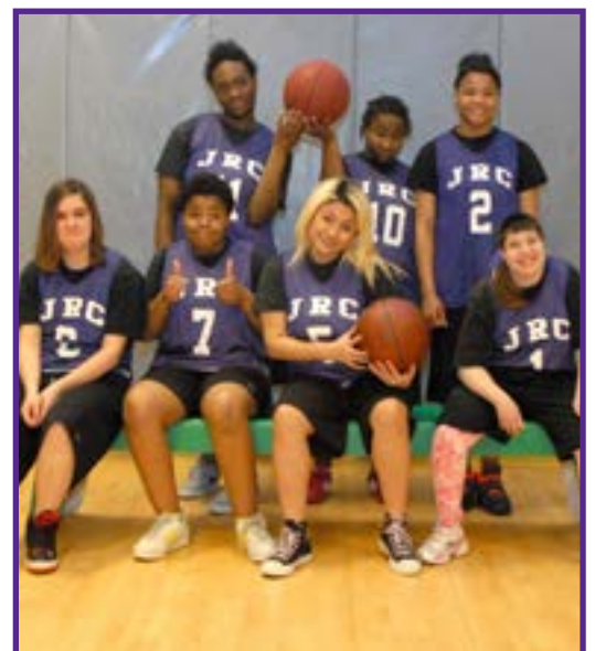
JRC's Girls Basketball Team