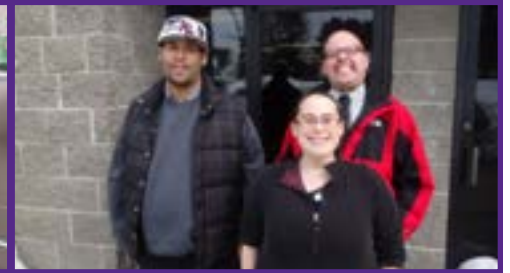
JRC volunteers at a local church...