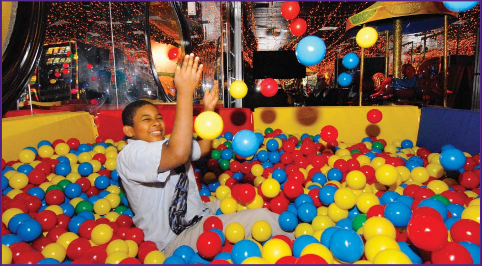
The Ball Pit is one of the most attractive features of the Big Reward Store.