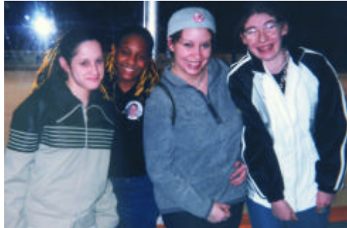
JRC students at a Providence Bruins game.