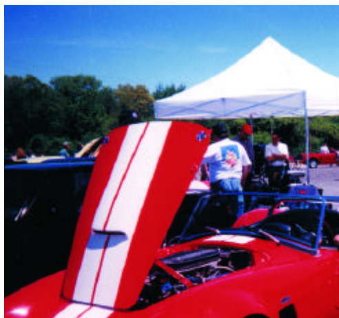
The students take a break from hiking in the Blue Hills Reservation to enjoy the view.