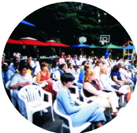
Students and staff take part in Culmination 1999.