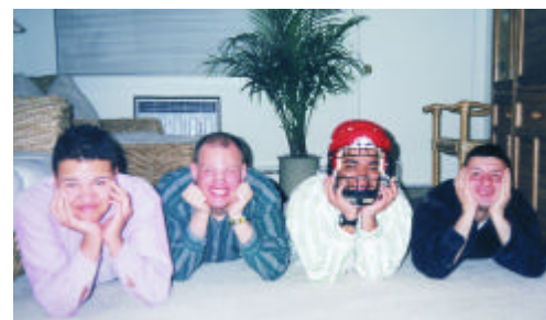
"The Get Along Gang" pose in their Woods Edge apartment in Attleboro.