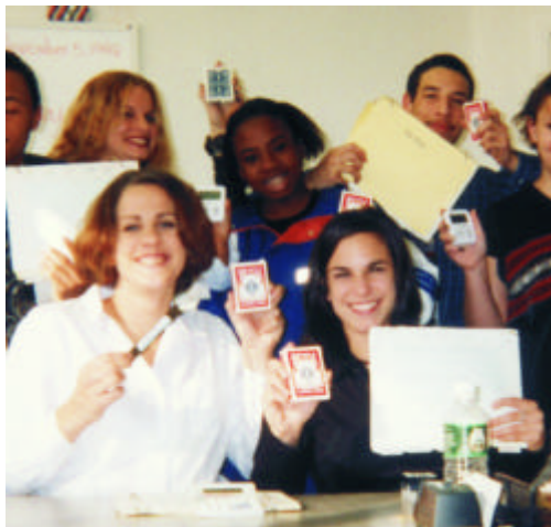
Precision Teaching in action!