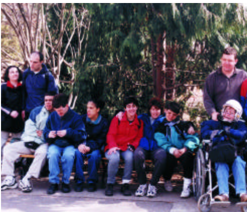
Hope School students have fun on the field trip to Roger Williams Zoo.