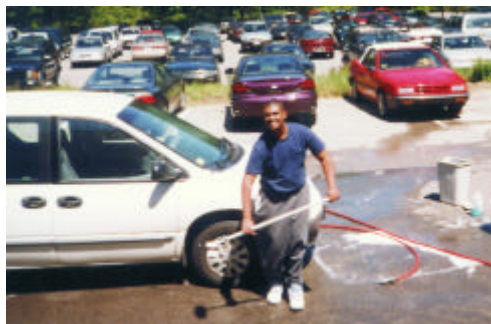
Don't forget to wash the rest of the car!